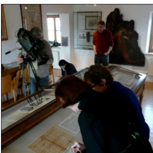
TV Crew at the Silent Night Museum, in Obendorf

“... one by one they came out to join the circle round the carollers”