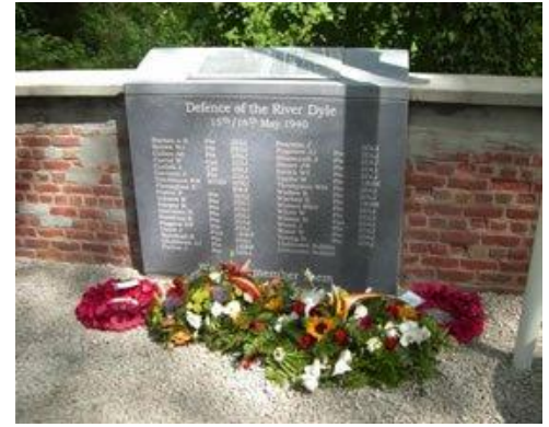
Defence of the river Dyle