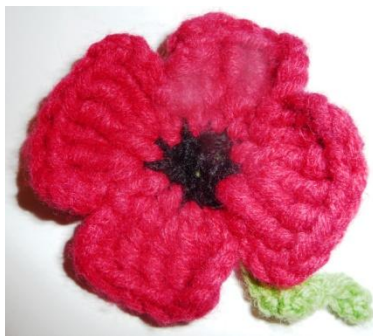
Kate's hand-crocheted poppy