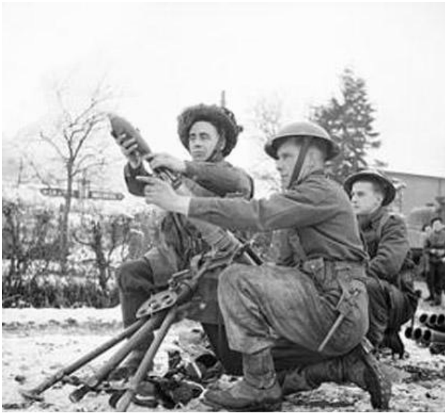
Figure 2. 3inch Mortar of 2nd Monmouthshire regiment during the advance towards la Roche in Belgium near Hotton, 5th January 1945