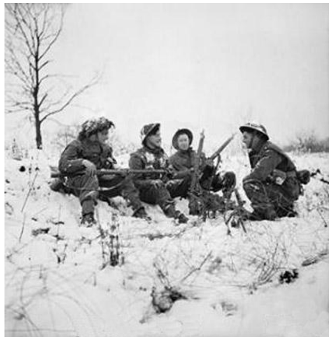
Figure 1. Infantry of 53rd Welsh division in the snow near Hotton 4th January 1945