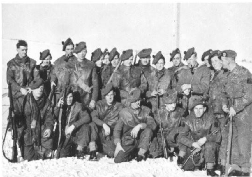
Figure 3. 51st Highland Division